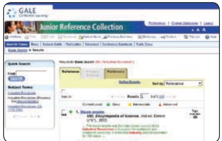
▲ Junior Reference Collection has an easy-to-use interface.